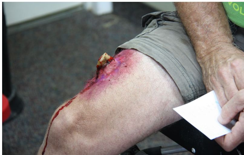
Another photo of Tom Wallin's moulage. This is an open mid-femur fracture from this year's Mass Casualty Incident Simulation

The most memorable drill for Tom was the one at Blue Mountain where the area specifically asked them to run an Continued on Page 8