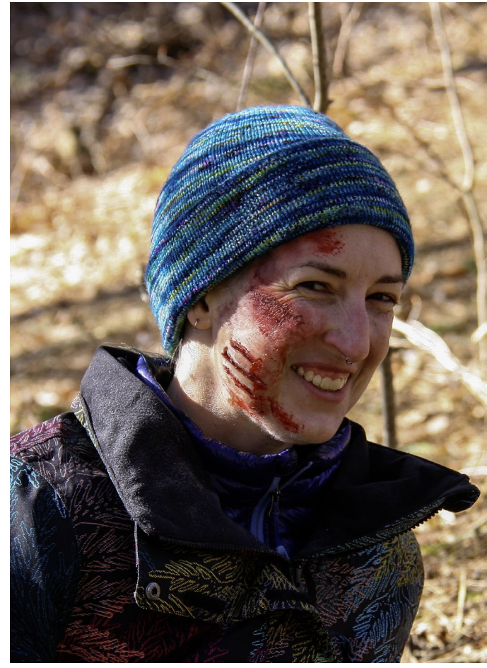
Even our volunteer patients seem to be having a good time!